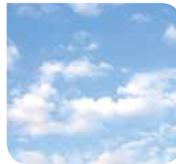
Low maintenance glass

How does it work? There are two processes. Firstly, the special coating harnesses the natural daylight which triggers the breakdown of the dirt and grime on the outside of the glass and secondly, when the rainwater hits the glass, rather than forming droplets,