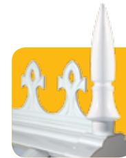
Global finial & Global cresting

The interlocking PVC-U sections of the crestings incorporate an interlock that ensures once connected they remain in a perfect line. There are decorative finial designs to suit every home and these are available in suited colours.